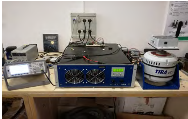
Figure 1 : Experimental set-up for testing WiseSensing frequency resolution in noisy environments